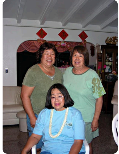
2007 July 25 Birthday Party