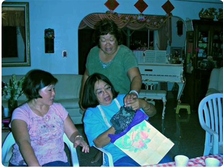
2007 July 25 Birthday Party